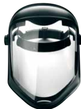
2,784 possible adjustment positions, 15 design patents, one revolutionary face shield.